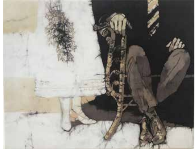
Wedding Shoes Sammy Lynn The ART Connection Batik