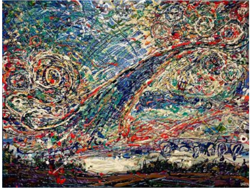
Temerity Laron McGinn Prairie 7 Acrylic