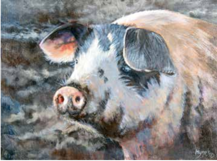
That's Some Pig Pam Hynek Fremont Area Art Association Acrylic