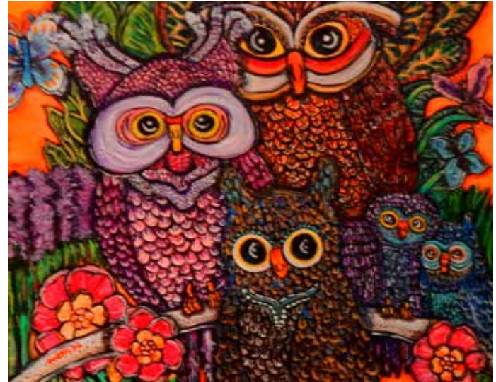
5 Little Owls Heather Horn North Platte Art Guild Acrylic