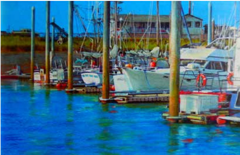
Tranquil Harbor Sue Perez North Platte Art Guild Colored Pencil