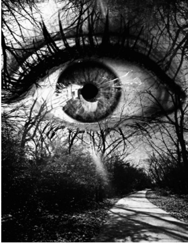
Varcolac Devyn Bonge An Electio Digital