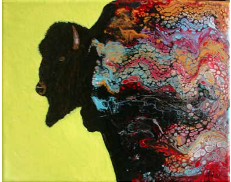
Buffalo Rainbow Doris Heath Sand Painters Art Club Acrylic Pour