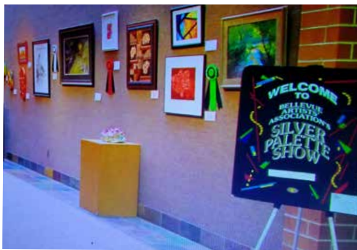
BAA exhibition at the Jewish Community Center of Omaha.