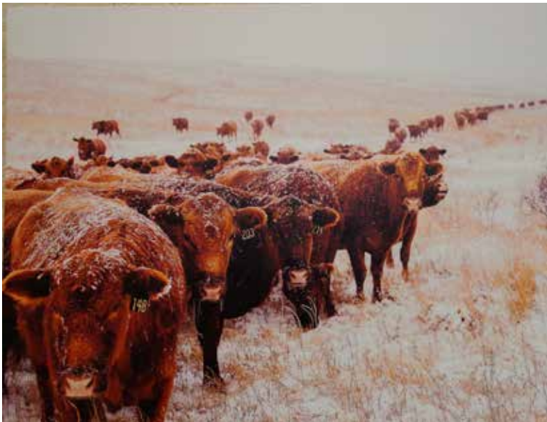
Mom Squad Megan Licking Thedford Art Guild Photography