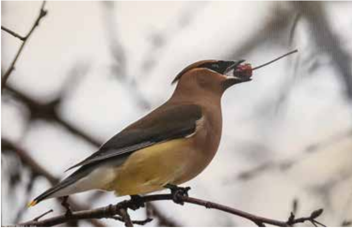
Waxwing with Crabapple Gerald Horst Mullen Arts Center Photography