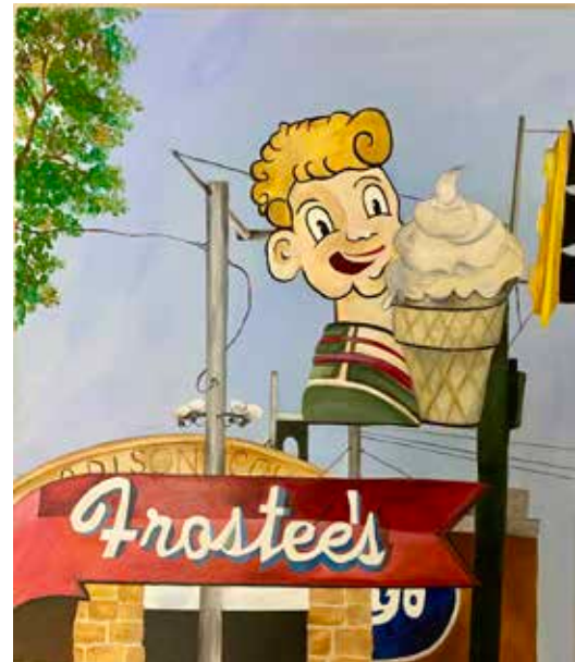
Winterset Paula Yoachim Bellvue Artists Acrylic