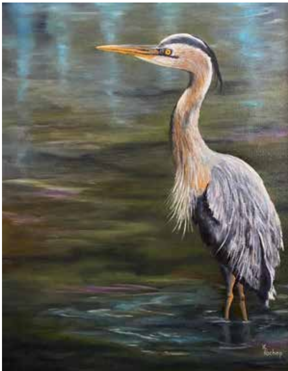
Wading Patiently Karen Pochop North Platte Art Guild Oil