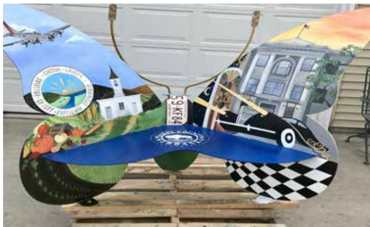
Several BAA artists painted butterfly benches for Papillion's Sesquicentennial.

Bellevue Artists Association is a non-profit club formed in 1974 to promote visual arts in the community. Meetings are held once a month on the second Tuesday at 7 pm at Anderson Grove Church, 12005 South 36th St, Bellevue NE.