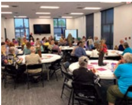
ANAC Conference Banquet

After last year's virtual conference, this year's attendees enjoyed firsthand participation in a variety of workshops, the ability to view submitted artwork in person, and the generous hospitality of the host city. Planned entertainment included a wine and cheese reception, an introduction to Custer County, a theatre showing of "Ocean of Grass," a Mexican fiesta dinner,