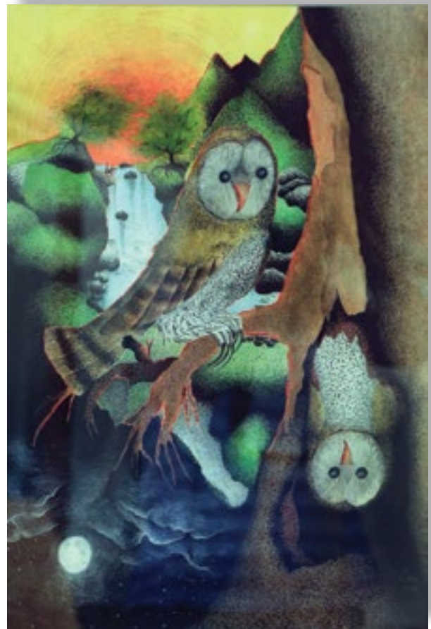
Day Divides the Night