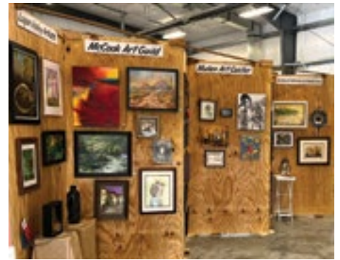
ANAC Art Show

much larger. According to Dowse, "We think there were 250!" Dowse also added that in her long history of attending ANAC conferences, she'd never seen that many people visiting a conference art exhibit.