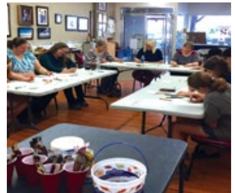
Community Art Workshop

The club selects their ANAC entries in an interesting way. To qualify for the ANAC conference the club holds an art show for members. Members must pay to enter the show and a judge selects the top pieces. Top winners receive ribbons, and a Best of Show is chosen. The number of pieces to advance to ANAC is determined by their membership number and the ANAC quota calculation. No artist may submit more than two pieces of art to the ANAC show.