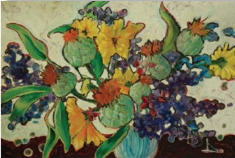
Bouquet #1 Diane Noonan Columbus Area Artists Oil