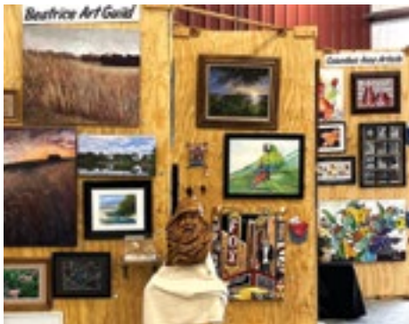
ANAC Art Show

much larger. According to Dowse, "We think there were 250!" Dowse also added that in her long history of attending ANAC conferences, she'd never seen that many people visiting a conference art exhibit.