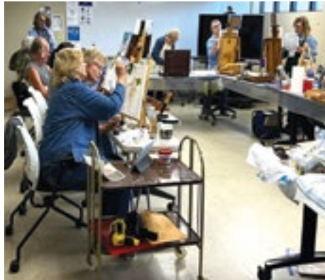
ANAC Conference Workshop