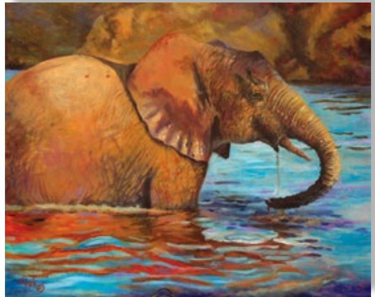
Sunset Swim Pam Hynek Fremont Area Art Association Acrylic