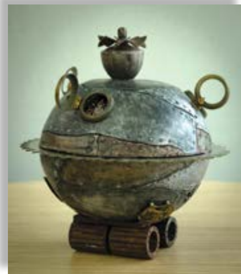
A Flying Saw-er