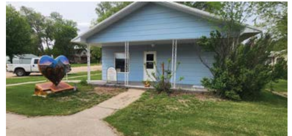
Thedford Art Guild, Thedford, Nebraska