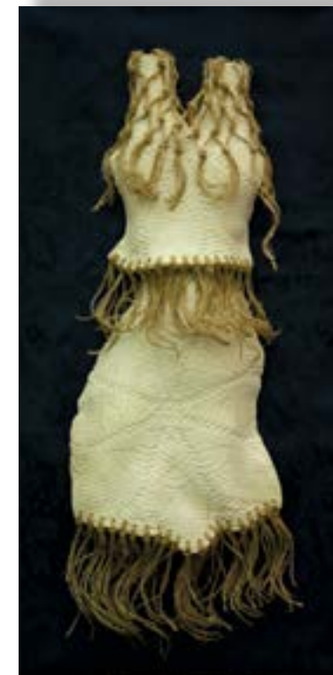
Pineapple Party Dress

Patricia Coslor Arrow Artists Watercolor