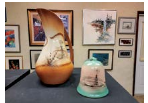
Event honoring the founding mothers of TAG

Originally nineteen artists and their family members kept the gallery open five days a week from 10:00 to 5:00 and all day on Tuesdays when the Livestock Sale was in town during the winter months. The first competitive photography show was held in 1982. The show has evolved and is now an open art show receiving entries from all mediums. The show hangs the whole