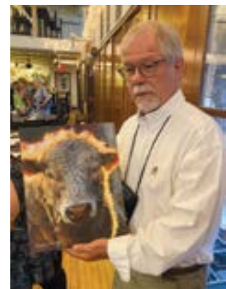
Best of Show "Holy Cow"