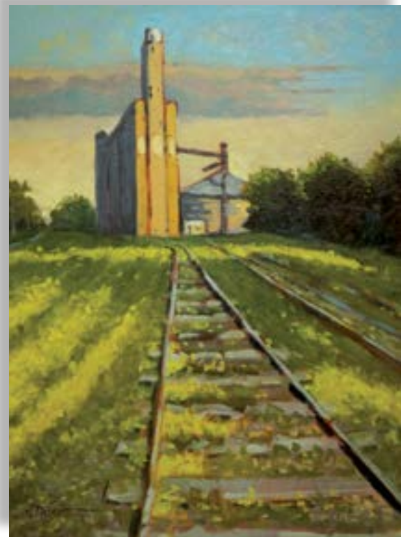
Morning Elevator at Fremont