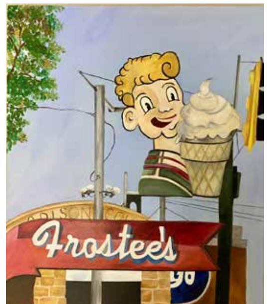
Winterset Paula Yoachim Bellvue Artists Acrylic