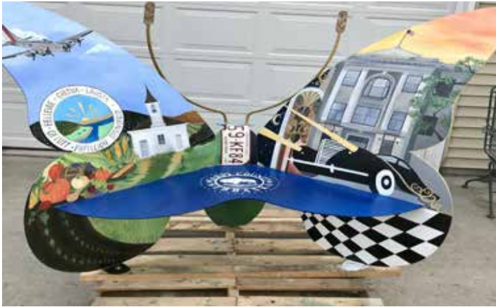
Several BAA artists painted butterfly benches for Papillion's Sesquicentennial.

Bellevue Artists Association is a non-profit club formed in 1974 to promote visual arts in the community. Meetings are held once a month on the second Tuesday at 7 pm at Anderson Grove Church, 12005 South 36th St, Bellevue NE.