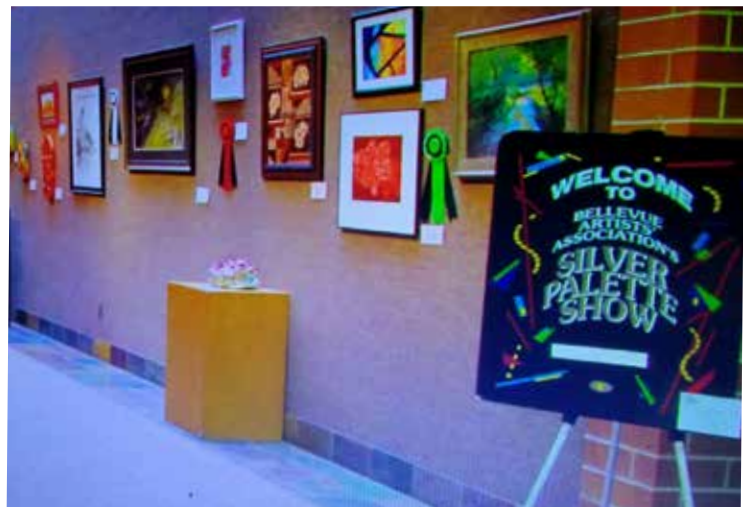
BAA exhibition at the Jewish Community Center of Omaha.