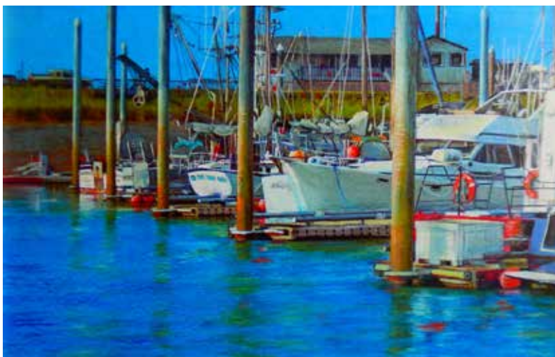
Tranquil Harbor Sue Perez North Platte Art Guild Colored Pencil