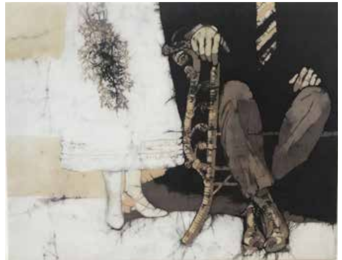
Wedding Shoes Sammy Lynn The ART Connection Batik