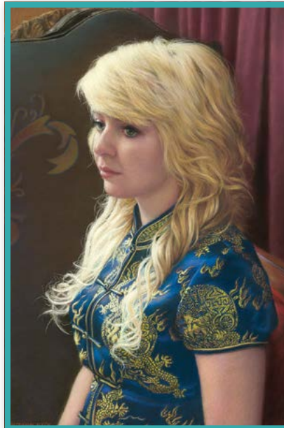
There Might Be Dragons